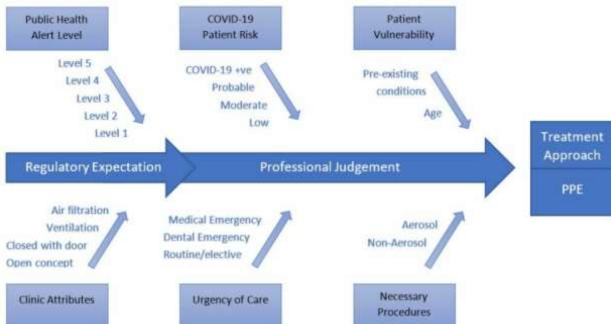
Figure 1 illustrates the ongoing need for professional judgment, as is always the case in providing dental care.

At all times, RDH's (registered dental hygienists) are expected to use their professional judgment based on the particular situation. There are many variables to consider, which change constantly (patient-to-patient, clinic-to-clinic, day-to-day) as the pandemic changes.